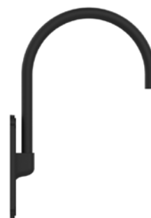
A 2 Wall Mount