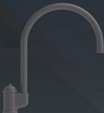
A 2 Single