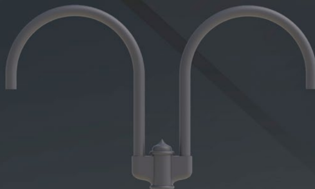
A 2 Double 180

Architectural Arm 2 is constructed of extruded aluminum tubing. Integrates with poles or tenons of 3-1/2", 4", 4-1/2", or 5" OD and is secured with 3/8" stainless steel Allen set screws.