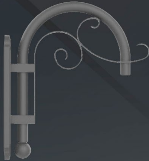
A17 Wall Mount Cast Wall Plate

Architectural Arm 17 is constructed of extruded aluminum tubing. Integrates with poles or tenons of 3-1/2", 4", 4-1/2", or 5" OD and is secured with 3/8" stainless steel Allen set screws.