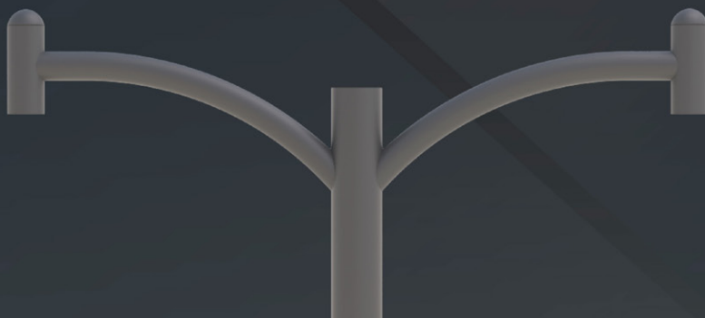
A 14 Double 180°

Architectural Arm 14 is constructed of extruded aluminum tubing and available for both post top and pendant mount luminaires. Integrates with poles or tenons of 3-1/2", 4", 4-1/2", or 5" OD and is secured with 3/8" stainless steel Allen set screws.